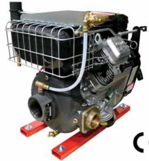
Maximum Full Throttle Performance

Designed as combination pump, the durable and powerful Waterous PB18-2515 is direct drive centrifugal pump powered by a V-twin Briggs and Stratton® 18 HP (13.4 kW) engine available with no base or rail base option. Fuel tank is 3-gallon (11 liter) fuel tank that meets the EPA evaporative requirement (40 CFR Part 1060).